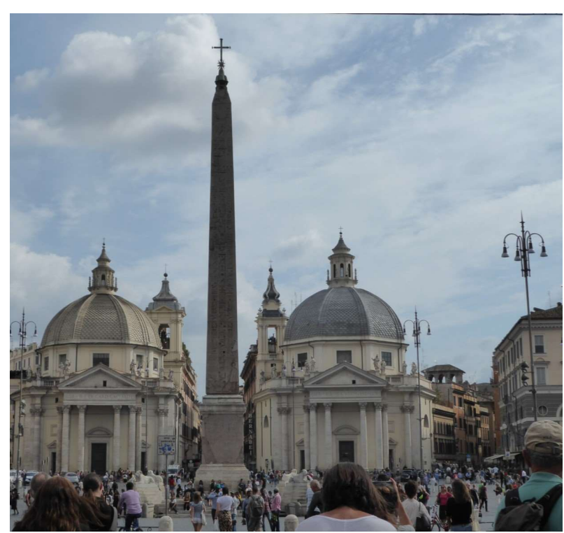
Piazza del Popolo 1975