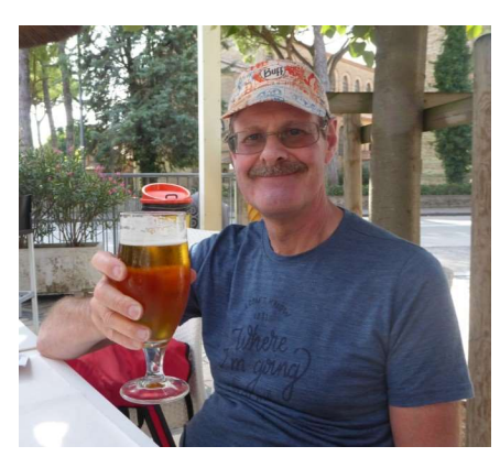
Happy New Year

<u>Contact Details &</u> 12 <u>forthcoming</u> <u>events</u>