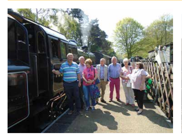
On 11 May 2017, 12 members and guests from the Waterbeach Fellowship club visited the Poppy Line – North Norfolk Railway.

Whilst any visit to this coastal steam railway is always very pleasant with glorious views across the Norfolk coast, on this occasion guided tours of the busy working Weybourne maintenance sheds and signal box were specially arranged for our members. These busy areas, manned by volunteers, are