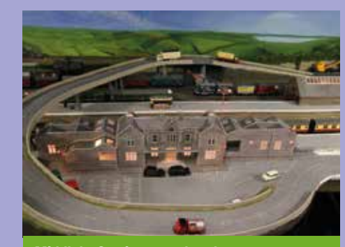
Middleby Station completed