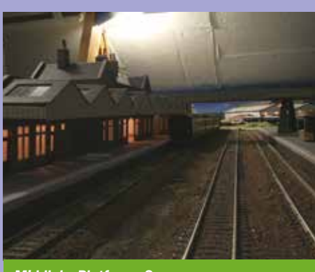
Middleby Platforms 3

line from Claggy Feet to Gleasdale runs after it crosses the line from Oredale to Middleby. The idea of making it hilly was to create the illusion of distance between the different rail lines. There is a lake (made using silver paint) among the trees which are made from pieces of sea moss coated with flakes of artificial foliage. A few trees are coated with lichen instead but, although that has been a standard modeller's method of making trees for many years, I do not find it very satisfactory.