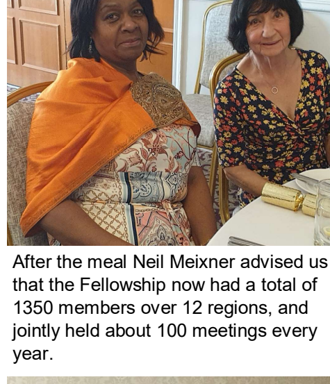
that the Fellowship now had a total of jointly held about 100 meetings every