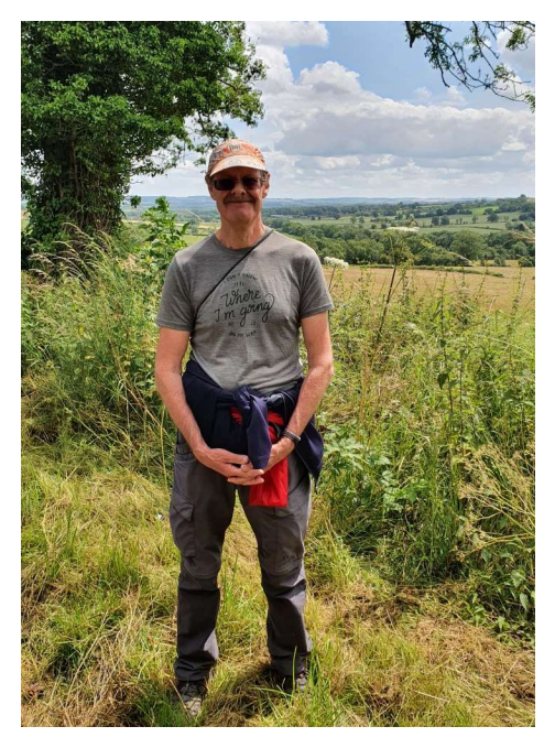
In the Cotswolds 2021