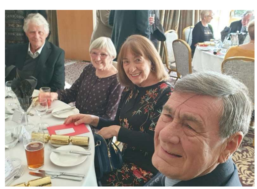
Members then had time to chat to others on different tables before heading home.