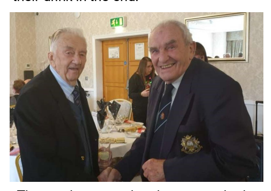
The meal was good and everyone had a nice chat with people on their own table.