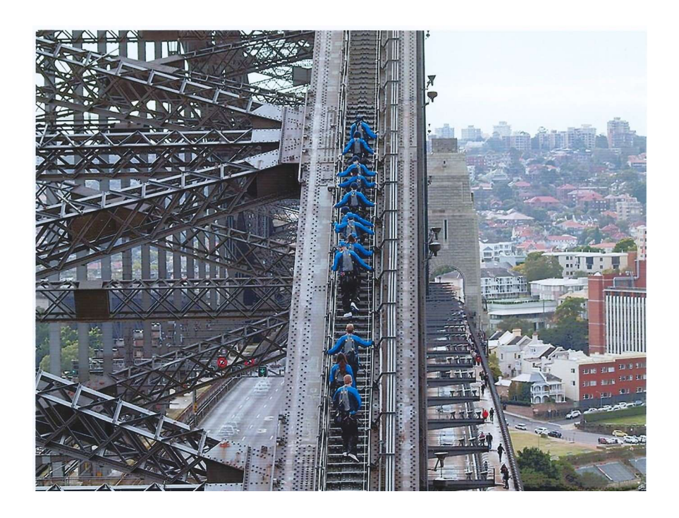
Up the staircase

Not content with his skydiving exploits Arthur sent some pictures of his earlier climb of the Sydney Harbour Bridge. This is no walk in the park, it takes 3 hours, and after walking under the roadway you have to climb 4 ladders before completing the walk up the long staircase, a total of 1332 steps to negotiate. Then of course you have to walk back again! Still once at the top you have magnificent 360° views including one of the iconic Sydney Opera House.