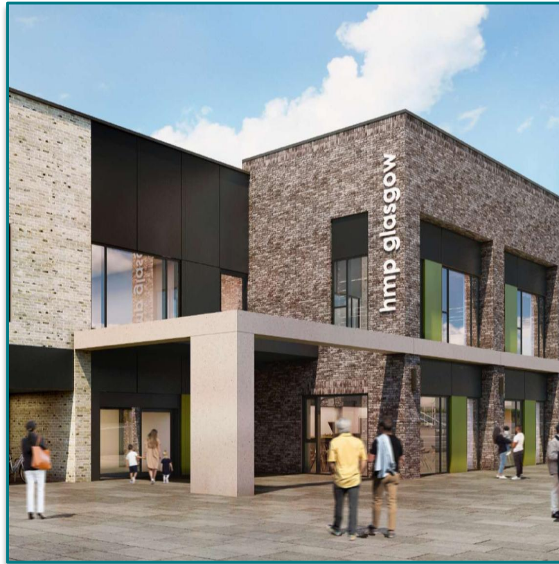
HMP Glasgow (under construction)