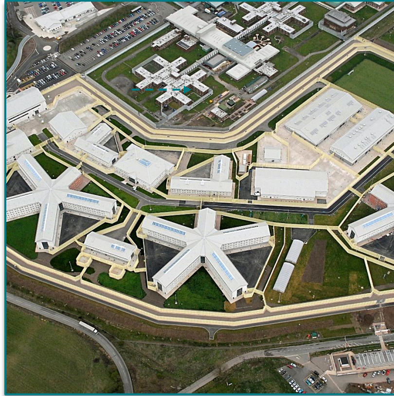
HMP Oakwood (2012)