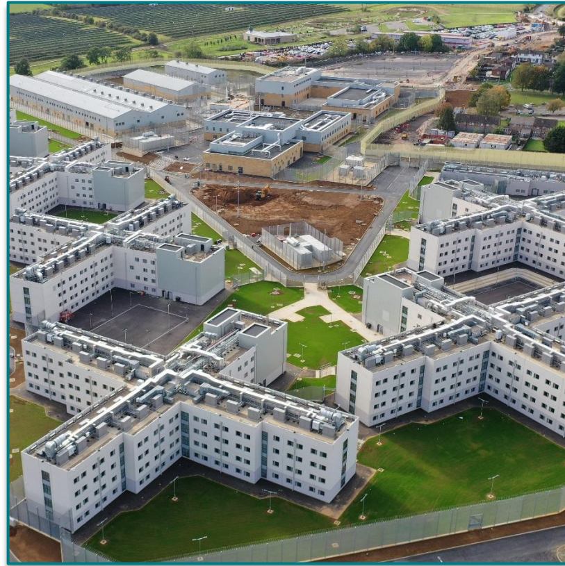
HMP Five Wells (2018)