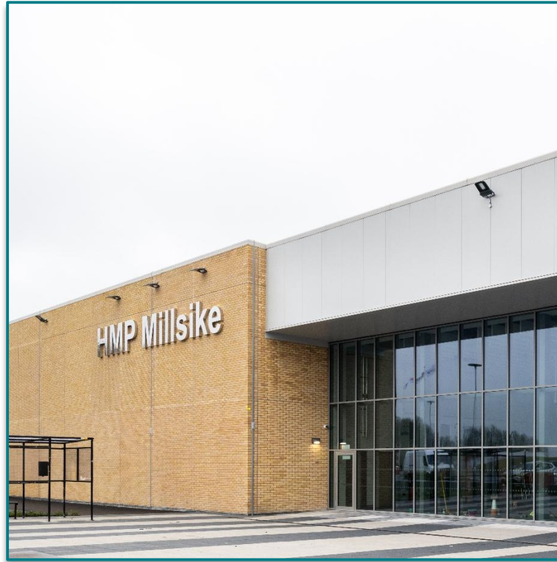
HMP Millsike (2025)